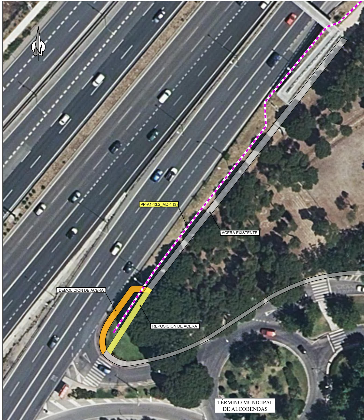
PLANTA SITUACIÓN ESCALA 1/300